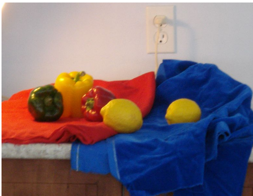
The still life

We started again with a landscape photo of fields and mountains before we progressed to a still life with peppers and lemons.